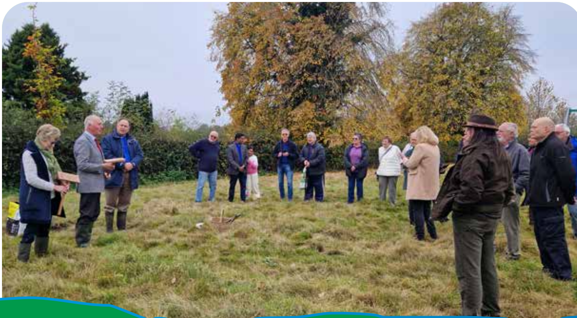
Tree planting - Ellastone