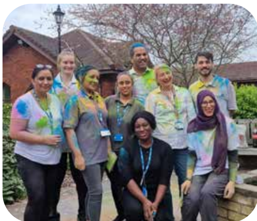
Anglican and other chaplains at Black Country Healthcare NHS Foundation Trust