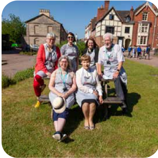
Staff and volunteers with the diocesan education team deliver 'Inspire' to hundreds of school children

There are different kinds of gifts, but the same Spirit distributes them. There are different kinds of service, but the same Lord. There are different kinds of working, but in all of them and in everyone it is the same God at work. (1 Corinthians 12:4-6, NIV)