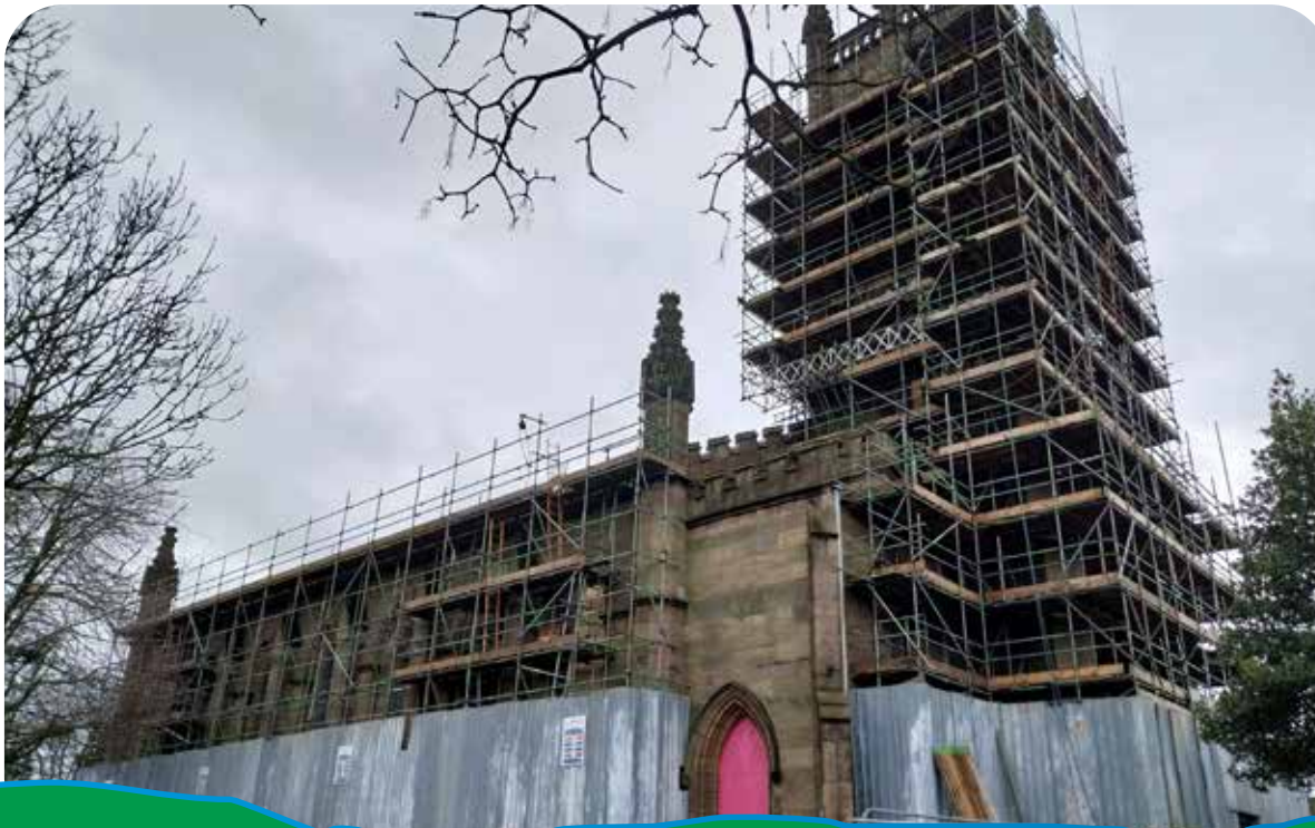
Major works at St Mark's Shelton during 2023-5

Buildings: the condition of nearly 200 of our church buildings was identified as being of concern in a recent audit.