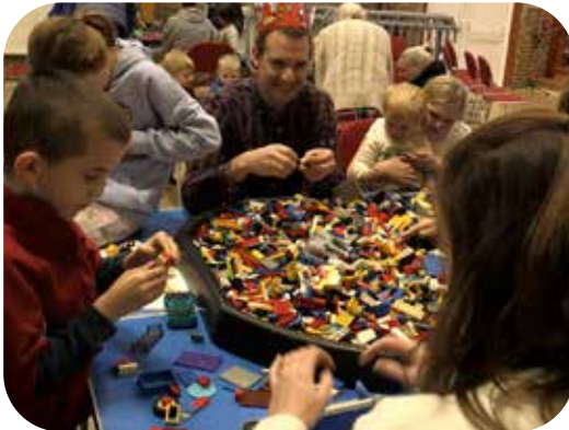
Brick Church - St Thomas, Aldridge