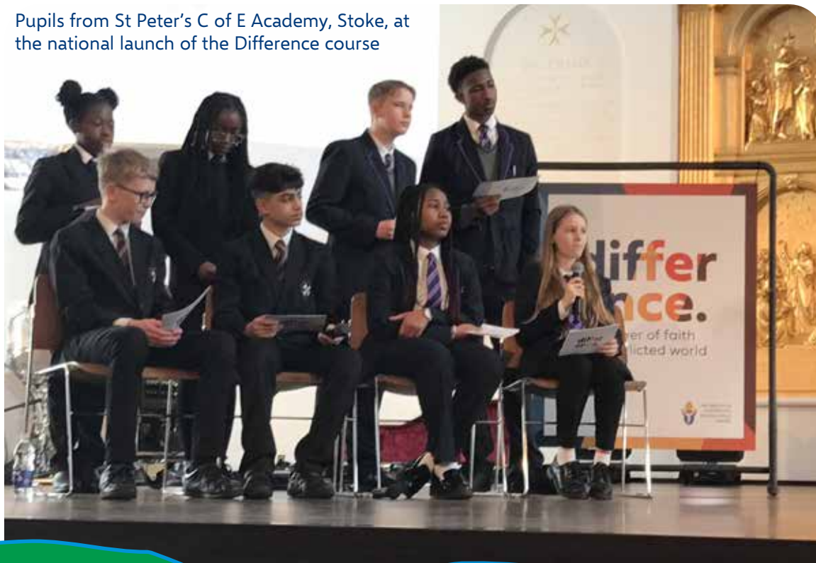
Pupils from St Peter's C of E Academy, Stoke, at the national launch of the Difference course