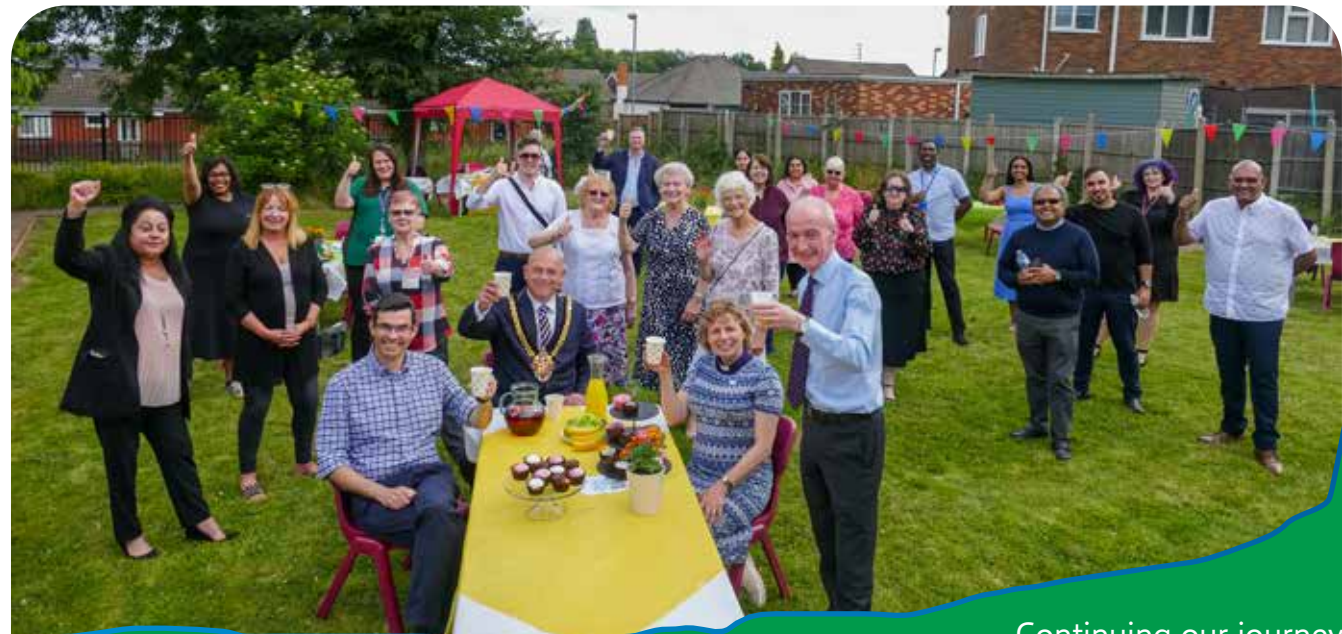
The Big Lunch - Bradley