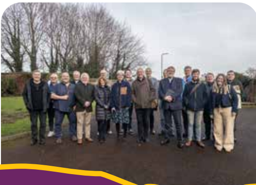
Clergy of the ‘larger churches’ network meeting in Lichfield

We need to take care of those who carry the weight of leadership in our diocese, especially in the most demanding of times. Our strategy is to ensure that all who exercise frontline ministry, and especially those in incumbent-level ministry and those leading worshipping communities, are enabled to flourish as human beings.