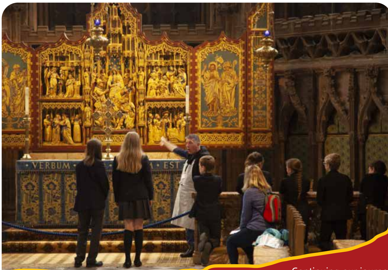
Pupils discovering the riches of Lichfield Cathedral as part of the Inspire programme