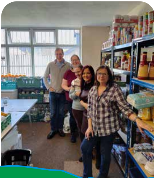
The Food Bank - Chell Parish Church

We need a pipeline of lay and ordained leaders for the future: the diocese has more than 400 parishes and more than 200 benefices, each of which needs