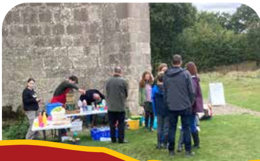
Forest Church service at Battlefield in the Severn Loop parishes

All people are created in the image of God and are equal in dignity and value. Our strategy is especially careful to ensure that people of all ages and from all different backgrounds are enabled to flourish as disciples.