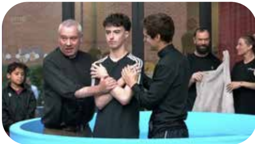
Baptisms at Aldridge Parish Church

Through our focus on Feeding our Faith, Supporting our Ministry, and Building up our Parishes and Communities we address our missional challenges and are free to journey together towards our vision.