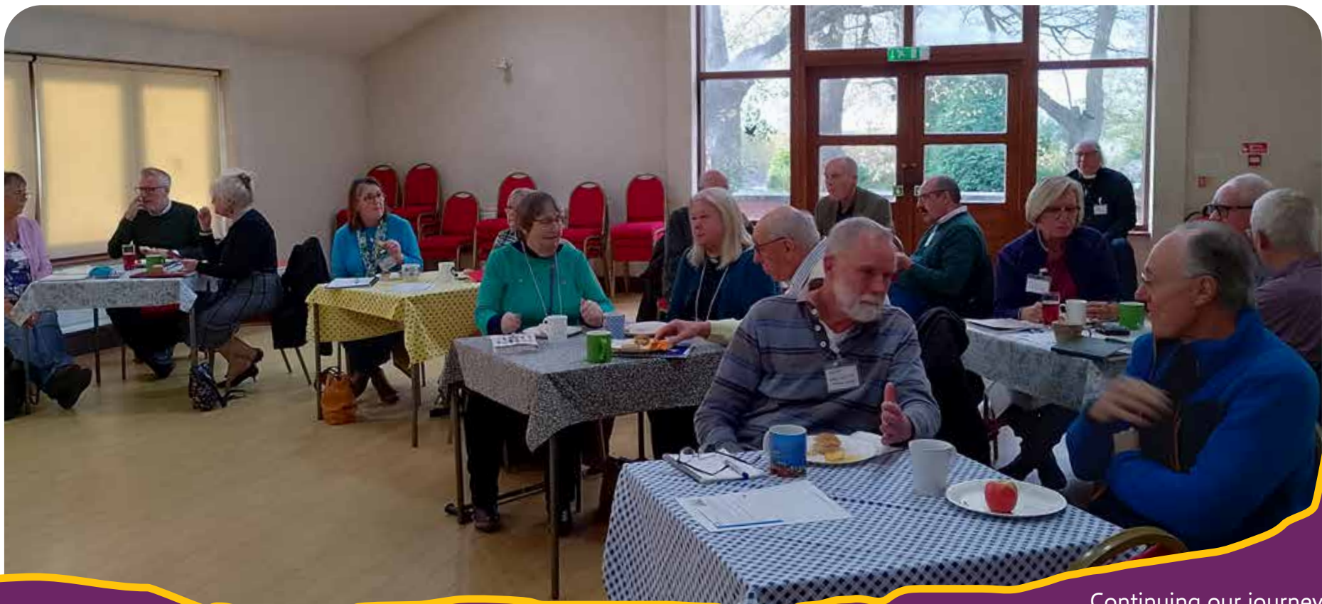
Churchwardens from around the diocese meeting for mutual support