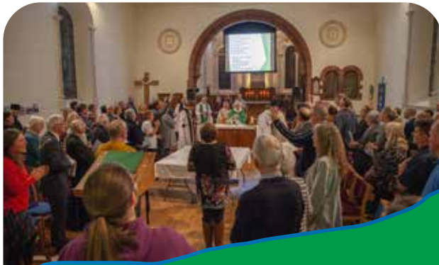
Clergy licensing at Wrockwardine Wood, Telford