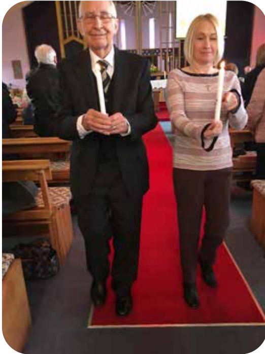
Church of the Holy Spirit, Harlescott