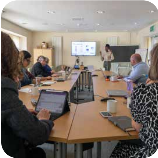
A seminar on the latest in social media delivered by the national CofE to diocesan staff

Focus is aided in two ways both of which address the issue of 'noise'. Noise happens when communications from the same organisation, or what is perceived by audiences as the same organisation, overlap either in time or content, or are too frequent! The message doesn't get through because it is not heard distinctly, or it is ignored because of overload. It's not the messages. Or the audience. It can be lack of planning and co-ordination. The creation of false expectations or lack of attention to how people give attention to things and why. The other source of noise is information overload, where everything received for dissemination is passed on without discrimination or discernment.