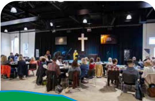
New meeting space at Telford Minster resource church

'Continuing our Journey' published by Lichfield Diocesan Board of Finance. Spring 2025