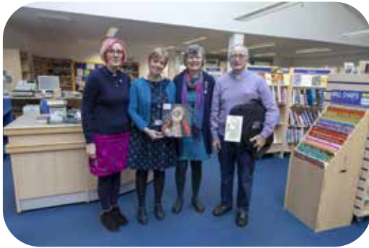
Ellesmere Deanery was the first in the country to have a full house of Dementia-friendly churches and offer support via the local library