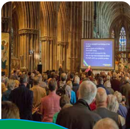
'First Steps' - Lichfield Cathedral 2017