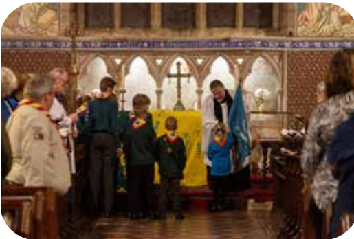
Youth organisations on parade - Hanbury

The Strategic Framework adopted by Diocesan Synod in 2024 yields the ten goals that express or en flesh this trajectory, this vision (a tenth goal, around Net Zero Carbon, was adopted by Diocesan Synod in 2025). Some of the goals contain numbers; these are not meant to be frightening, or strict measures against which a judgement of success or failure will be made. Instead, they are the inspiration, painting a picture of what could be.