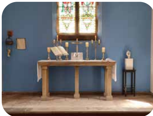
Chaplaincy - Ellesmere College