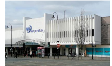
Wulfrun Centre in Wolverhampton is one of many shopping destinations in the region

If shopping is your thing, there is a range of options, from the chic boutiques at Barton Marina, and Shrewsbury to large malls in or near the urban centres. We're fortunate in being the home of many fine ales and beers brewed in Burton on Trent (the museum is well worth a visit), and Staffordshire oatcakes are a unique local delicacy to be discovered.