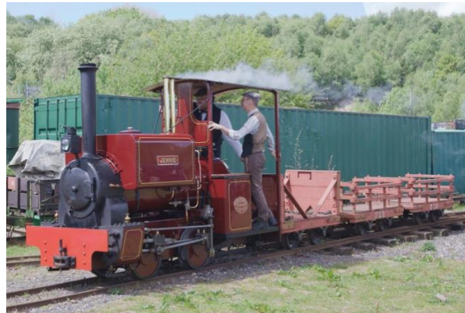
Apedale Valley Light Railway nr Stoke is one of many transport and leisure museums in the Diocese