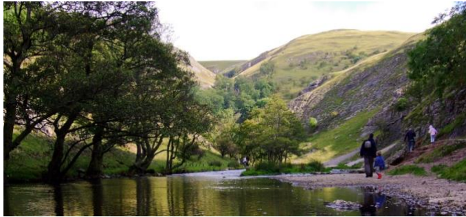
Dovedale (location of one of the Diocese's two residential retreat centres)