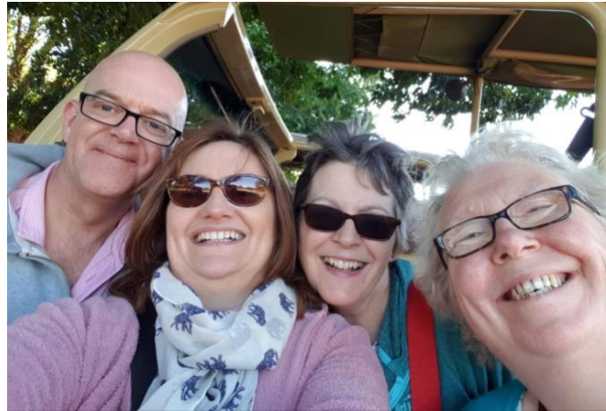
Many second year curates have the opportunity to grow through visits to our link dioceses in Canada, Africa, or Germany– this group enjoying a day on safari.

This programme is accredited within Common Awards. Many curates who already have a Diploma award from IME1 are registered for a BA in Theology, Ministry and Mission. Others who already have a degree or higher award can be registered for a Graduate Diploma. Those who are recognised as potential theological educators have opportunities to further their studies alongside their curate programme