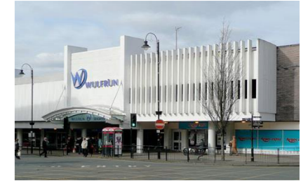
Wulfrun Centre in Wolverhampton is one of many shopping destinations in the region

If shopping is your thing, there is a range of options, from the chic boutiques at Barton Marina, and Shrewsbury to large malls in or near the urban centres. We’re fortunate in being the home of many fine ales and beers brewed in Burton on Trent (the museum is well worth a visit), and Staffordshire oatcakes are a unique local delicacy to be discovered.