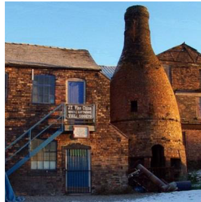
Stoke-on-Trent Bottle Kiln

Staffordshire prides itself on being ‘the Creative County’: Shropshire is the birthplace of the Industrial Revolution and the Black Country is renowned for its industry and all have significant opportunities for spouses who wish to develop careers in any sphere.