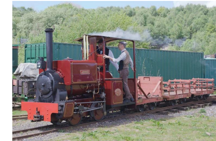
Apedale Valley Light Railway near Stoke with the adjacent country park and Heritage Centre is one of many transport and leisure museums in the Diocese / Simon Jones