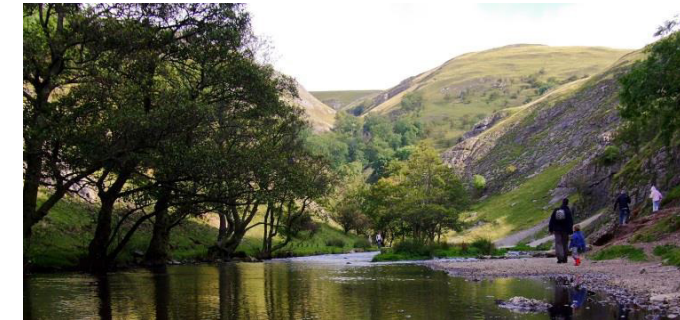
Dovedale (location of one of the Diocese’s two residential retreat centres)

Rail links are also good with all major towns having direct services to London and Birmingham and four major airports surround our borders – Birmingham, East Midlands, Manchester and Liverpool.