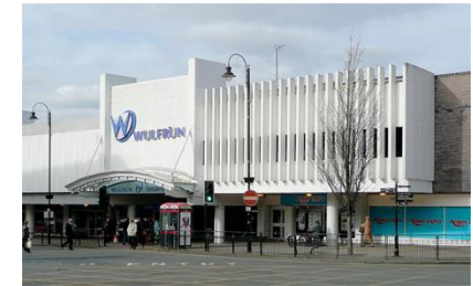
Wulfrun Centre in Wolverhampton is one of many shopping destinations in the region

If shopping is your thing, there is a range of options, from the chic boutiques at Barton Marina, and Shrewsbury to large malls in or near the urban centres. We’re fortunate in being the home of many fine ales and beers brewed in Burton on Trent (the museum is well worth a visit), and Staffordshire oatcakes are a unique local delicacy to be discovered.