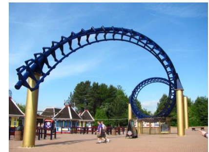
Alton Towers near Uttoxeter