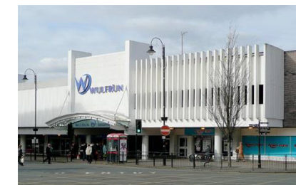
Wulfrun Centre in Wolverhampton is one of many shopping destinations in the region

If shopping is your thing, there is a range of options, from the chic boutiques at Barton Marina, and Shrewsbury to large malls in or near the urban centres. We’re fortunate in being the home of many fine ales and beers brewed in Burton on Trent (the museum is well worth a visit), and Staffordshire oatcakes are a unique local delicacy to be discovered.