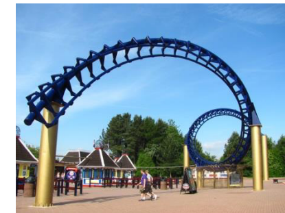
Alton Towers near Uttoxeter