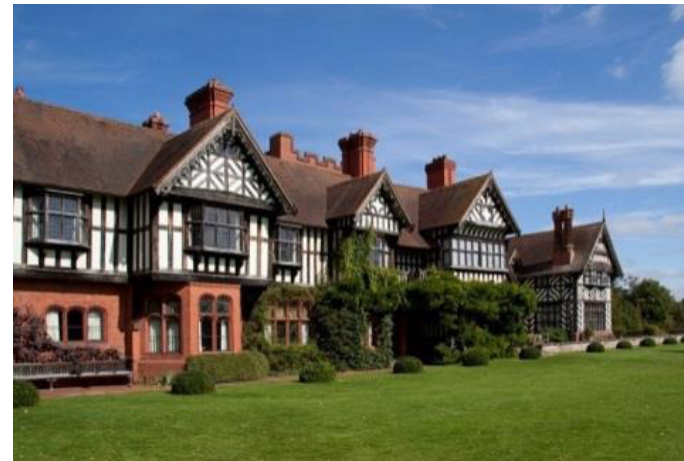
Wightwick Manor nr Wolverhampton / Tony Hisgett (Wikipedia) / CC BY-SA 4.0