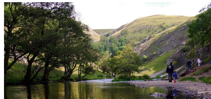
Dovedale (location of one of the Diocese’s two residential retreat centres)

Rail links are also good with all major towns having direct services to London and Birmingham and four major airports surround our borders – Birmingham, East Midlands, Manchester and Liverpool.