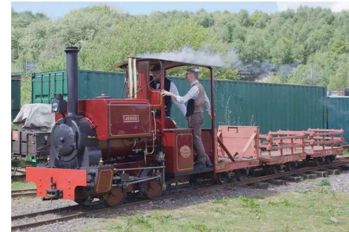
Apedale Valley Light Railway near Stoke with the adjacent country park and Heritage Centre is one of many transport and leisure museums in the Diocese / Simon Jones