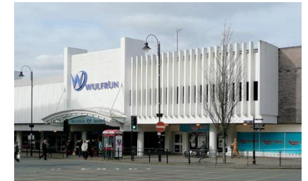
Wulfrun Centre in Wolverhampton is one of many shopping destinations in the region

If shopping is your thing, there is a range of options, from the chic boutiques at Barton Marina, and Shrewsbury to large malls in or near the urban centres. We're fortunate in being the home of many fine ales and beers brewed in Burton on Trent (the museum is well worth a visit), and Staffordshire oatcakes are a unique local delicacy to be discovered.