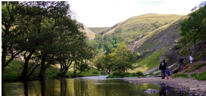
Dovedale (location of one of the Diocese's two residential retreat centres)