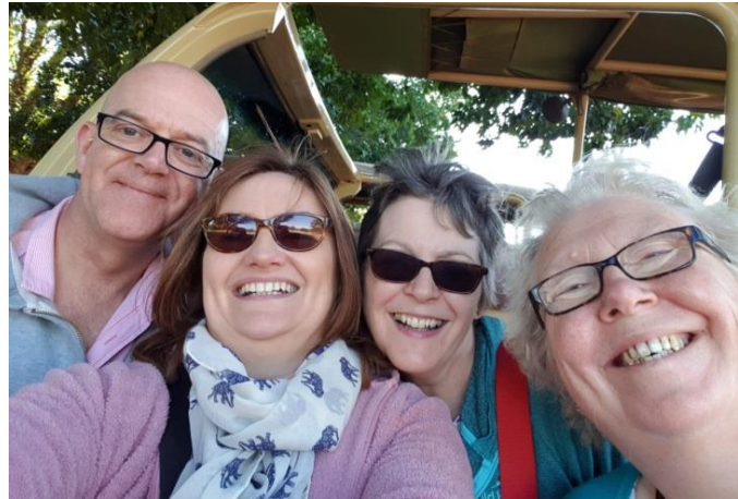
Many second year curates have the opportunity to grow through visits to our link dioceses in Canada, Africa, or Germany– this group enjoying a day on safari.

Alongside the IME2 training you may wish to continue studying on an accredited pathway with Common Awards. Curates who already have a Diploma award from IME1 may register for a BA in Theology, Ministry and Mission. Others who already have a degree or higher award or are recognised as potential theological educators have opportunities to further their studies alongside their curate programme.