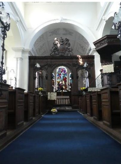
St Mary the Virgin Ingestre

As a benefice we offer an excellent opportunity for sharing the gospel in a suburban and rural context. The individual churches do this with differing community engagement strategies. We look to use the gifts of the individual to bless the whole. At St John's in Littleworth there are activities for all ages; with a heart to reach the community. The modern building with flexible space enables modern worship and opportunities for courses and social activities.