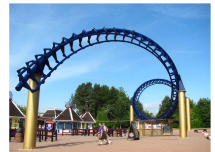
Alton Towers near Uttoxeter