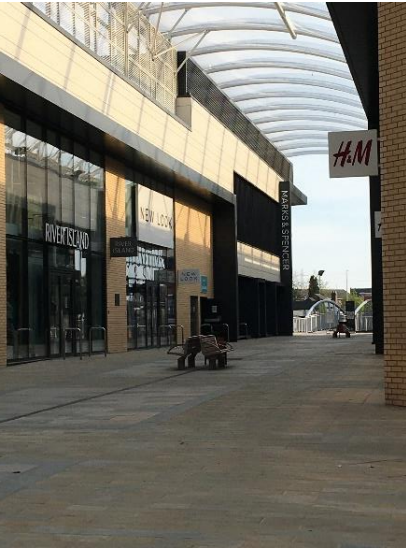
Stafford town centre