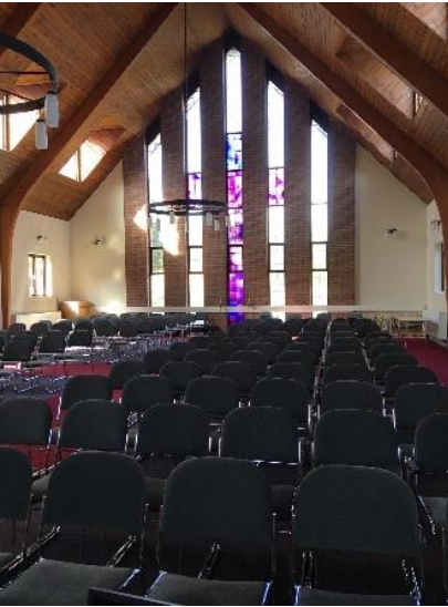
St John the Baptist, Littleworth