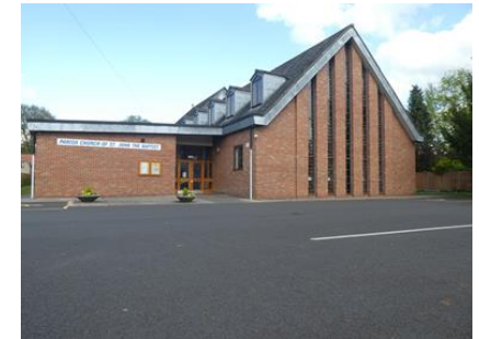
St John the Baptist Littleworth