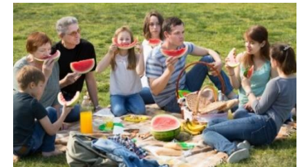
Messy Church fun and summer benefice picnic